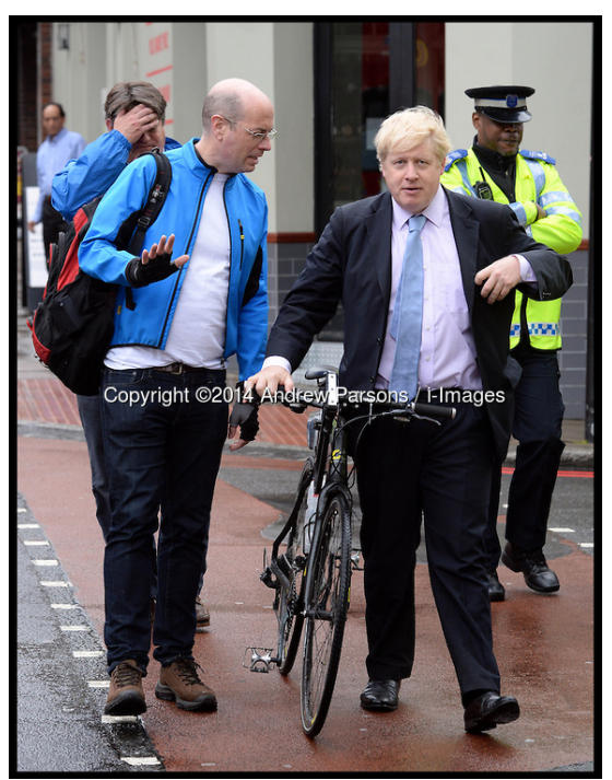
Gilligan DEFENDED racist and homophobic language <a href="https://www.theguardian.com/commentisfree/2008/nov/21/london-boris">https://www.theguardian.com/commentisfree/2008/nov/21/london-boris</a>

Evening Standard and later, the Telegraph. This despite Johnson having a history of uttering racist or derogatory words in relation to minorities.