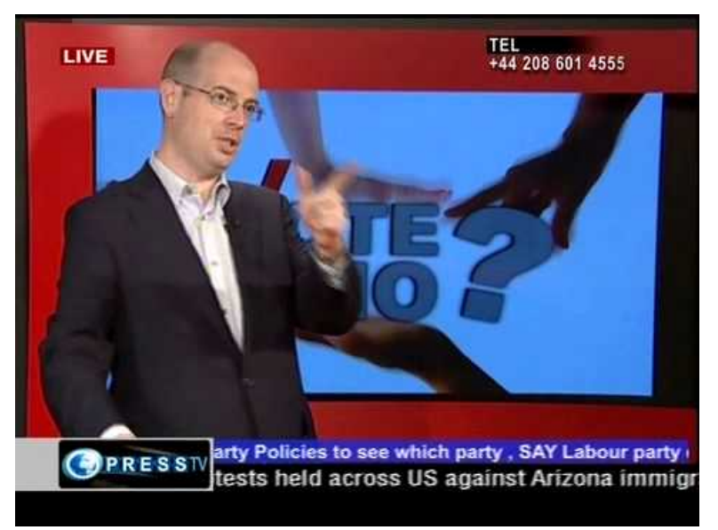
Gilligan was paid by an ANTI-SEMITIC and EXTREMIST regime. https://www.youtube.com/watch?v=bbymr-A5c2g

• The 'Islamist regime's '£5,000 a week' mouthpiece - Gilligan has embraced a perverse McCarthyite obsession in outing "Islamists" but himself has worked for such media organs as Press TV - the propaganda arm of the Islamic Republic of Iran.